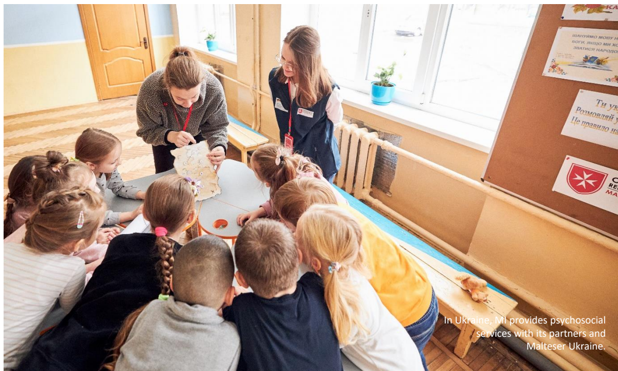
In Ukraine, MI provides psychosocial services with its partners and Malteser Ukraine.

Globally, we are united by the goal of standing alongside the displaced and people in need. Together, we're working to build a life of health and dignity.