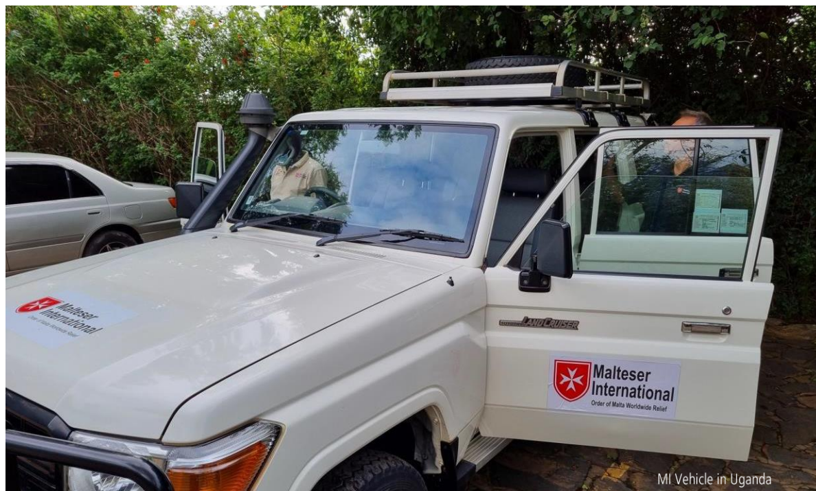
MI Vehicle in Uganda

The misuse of professional equipment may lead to disciplinary action.