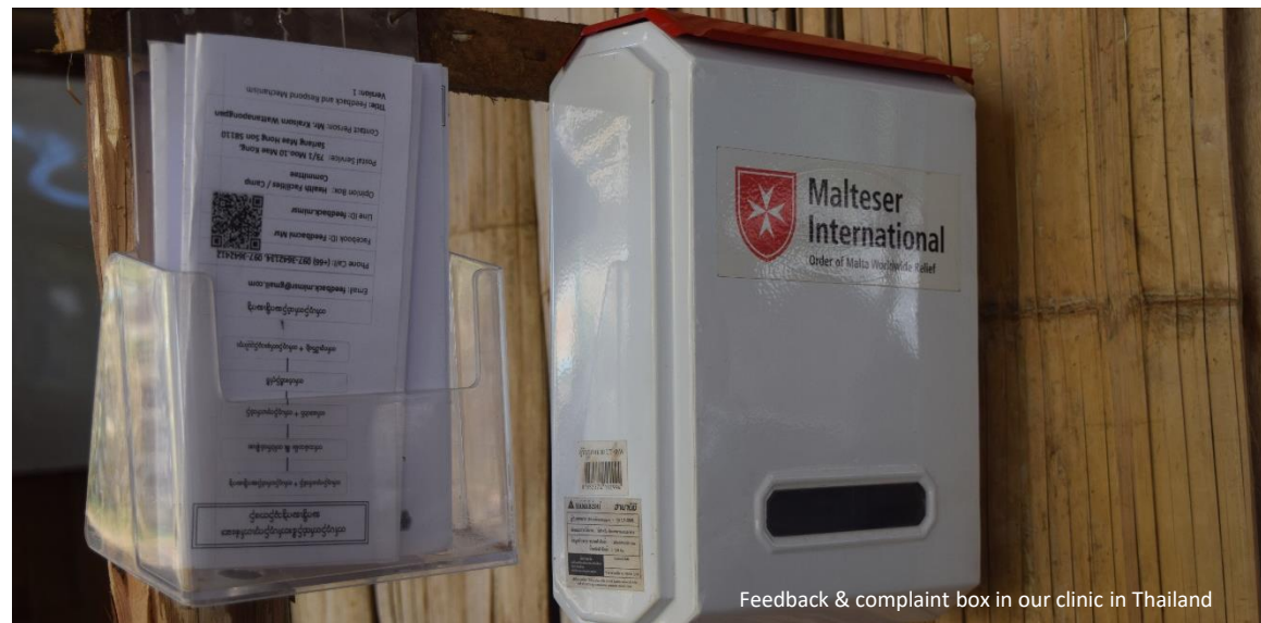
Feedback & complaint box in our clinic in Thailand

The Complaint and Response Mechanism is explained in detail in the Safeguarding Guideline .